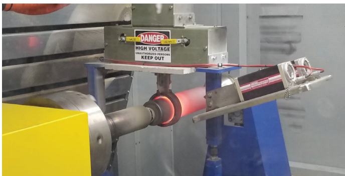
Automated induction fusing

For more information, visit spraywelder.com .