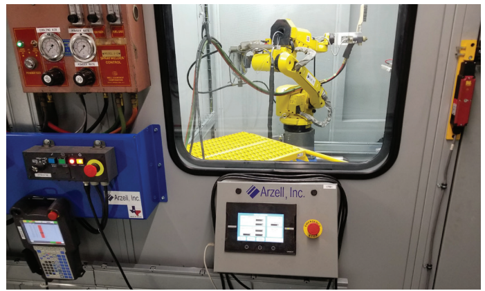
Electrical control valve system

Due to a high demand from customers to automate their processes, Wall Colmonoy team is dedicated to custom integration of automation and equipment and offers an automated Spraywelder™ Solution.